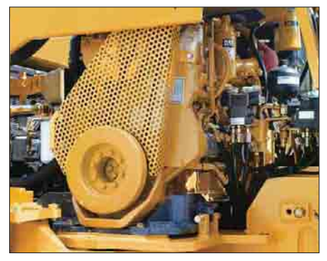
Large engine service doors provide optimum access to engine and hydraulic components from ground level.

Large service doors. Large service doors provide optimum access to engine and hydraulic components. Engine side covers swing wide to allow ground-level access to engine and rear cover swings up for access to radiator and oil cooler.